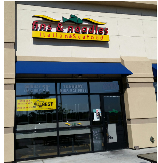
Fins and Noodles supports Cherry Knolls (Check directory for coupon)

Hours of operation are: Mondays – Saturdays, 10:30 a.m. to 8:30 p.m., closed Sundays. If you have not done so, check out Fins & Noodles.