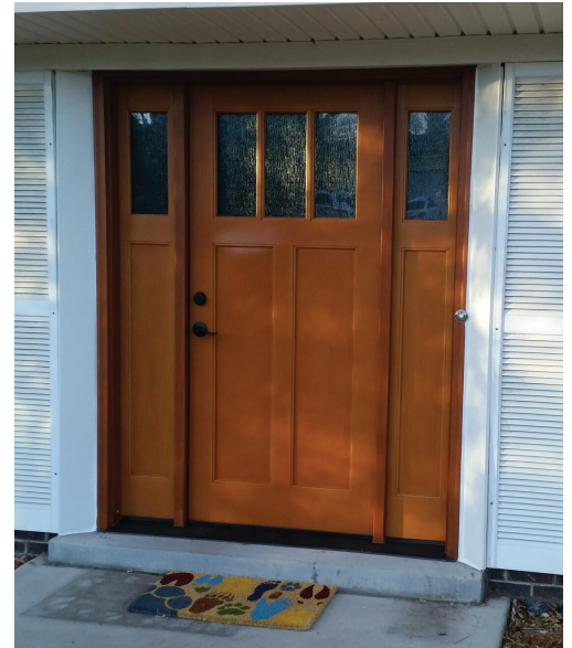
Parks Residence, 6801 S. Cook Way

Thanks for making improvements to our neighborhood.