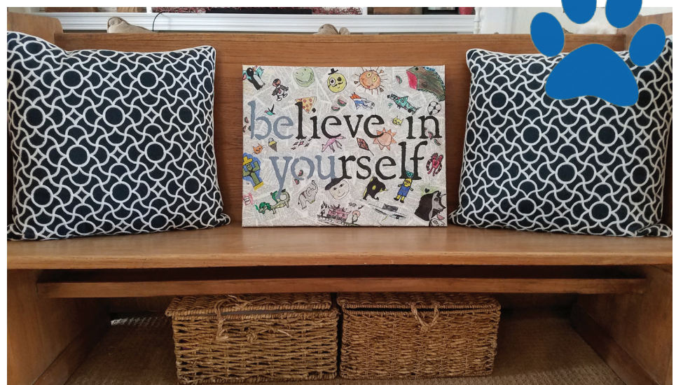
One of the classroom auction projects. available soon!

Please contact us at sandburgpto@gmail.com with any questions or if you would like to make a donation. Bid high and often at the 2017 Sandburg Online Auction!