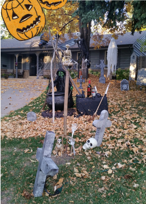
Scariest neighbor award!! Bigger and badder than ever!!