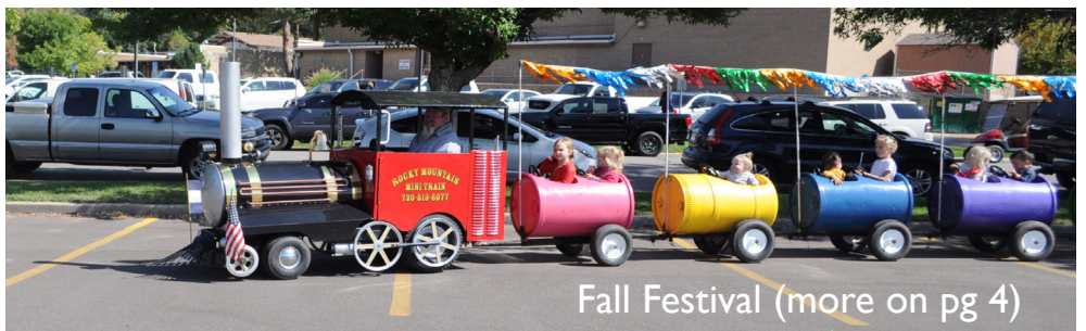
Fall Festival (more on pg 4)