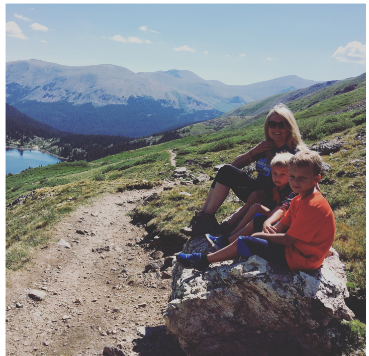
Silver Dollar Lakes Trail near Georgetown

For more hike ideas check out the AllTrails website and app. Remember to be below treeline for afternoon storms, and always tell someone about your plans.