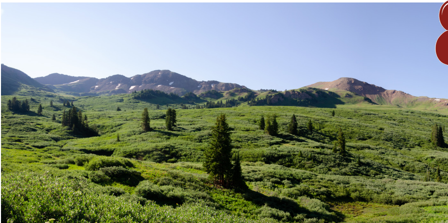
West Maroon Trail outside of Crested Butte