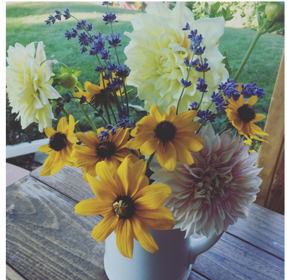
Lavender is a favorite of bees