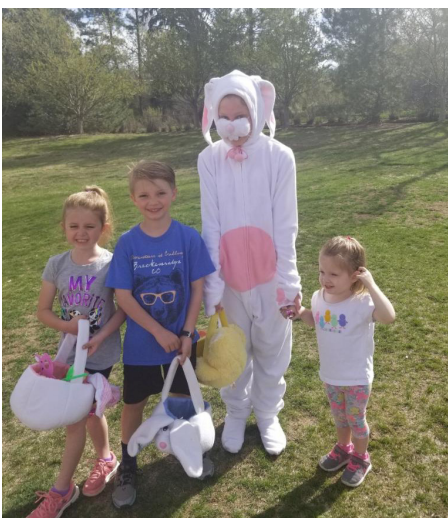
Thank you to everyone who helped make the Easter Egg Hunt a Success!