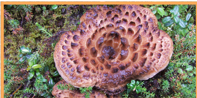
Mushrooms of Colorado: HAWK'S WING ( Sarcodon imbricatus )