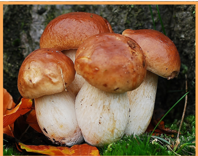
Mushrooms of Colorado: PORCINI ( Boletus edulis )