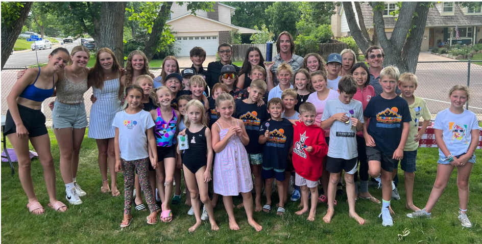
2023 Cherry Knolls Neptunes Finalists and Coaches

Huge thanks to all of the coaches, parent reps, and volunteers. See you in 2024!